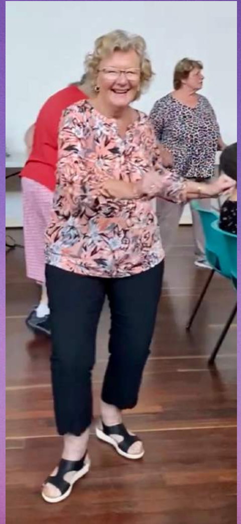
Fun...Fun... Fun @ Seniors Week 2022